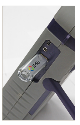
USB flash drive supports transferring test results