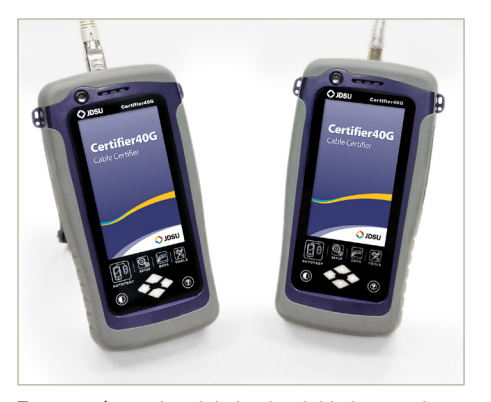
Two complete units minimize time initiating, naming, and saving results

*Please specify regional cables: North America (NA) Type A, European (EU) Type C, United Kingdom (UK) Type G, Australian (AU) Type I.