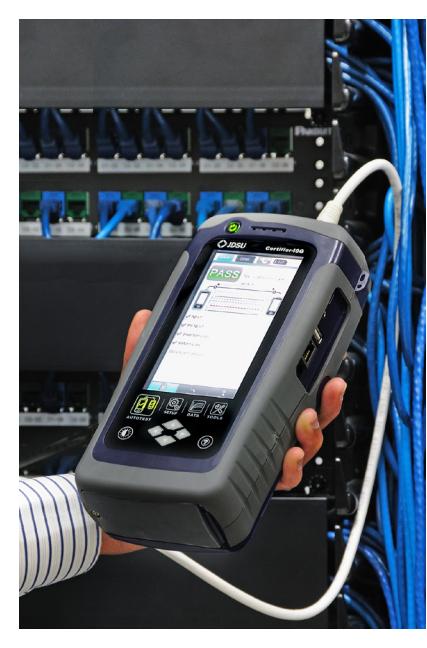
Easy-to-use large, graphical touch screen