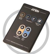
IR Remote Control Included