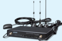
EN50155 4G LTE/GPS/Wi- Fi Gateway VCG-1500WG-LTE