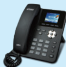
HD Color PoE IP Phone VIP-1120PT