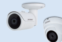
H.265 1080p Smart IR Bullet IP Camera ICA-3280/ICA-4280