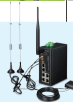
Industrial 4G LTE/GPS Gateway ICG-2510WG-LTE