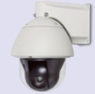
2 Mega-pixel PoE Plus Speed Dome IP Camera with Extended Support ICA-E6260