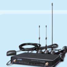
Vehicle 4G LTE Cellular Wireless Gateway VCG-1500WG-LTE