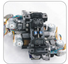
Integrated fiber-adjust frame

Optical imaging system ranks No. 1 in the world