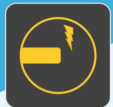
Fiber endface melter & fusion splicer 2 in 1