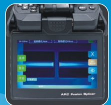
5" touch screen