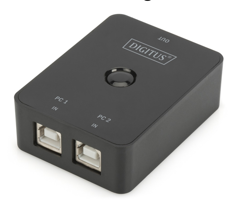
User Manual DA-70135-2