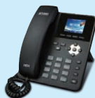
HD Color PoE IP Phone VIP-1120PT