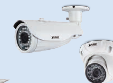
1080p IR Bullet/Dome PoE IP Camera ICA-3250/ICA-4250