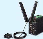
Industrial 4G LTE/GPS Gateway ICG-2420G-LTE