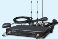
EN50155 4G LTE/GPS/ Wi-Fi Gateway VCG-1500WG-LTE