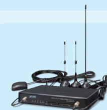
Vehicle 4G LTE Cellular Wireless Gateway VCG-1500WG-LTE