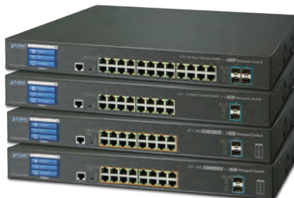
L2+ 16/24-Port Gigabit + 2-/4-Port 10GbE SFP+ Managed Switch with Color Touch LCD