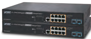
L2+ 8-Port 2.5G 802.3at PoE + 2-Port 10G SFP+ Managed Multigigabit Switch