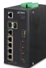
Industrial Modbus L2+ 4-Port Gigabit Ultra PoE Managed DIN-rail Ethernet Switch