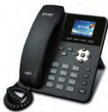
Color LCD IP Phone