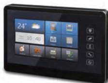
SIP Indoor Station