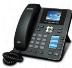
Dual Color LCD IP Phone