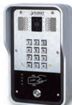
SIP Door Phone