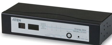
● EC2004 front view