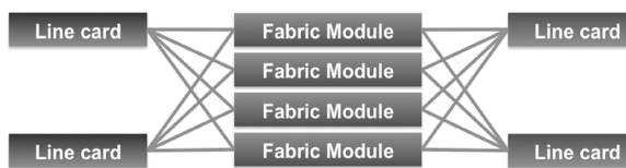
Advanced CLOS Architecture