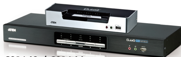
CS1642 / CS1644

The CS1732B and CS1734B are, respectively, 2- and 4-port desktop KVM™ switches that support multiple platforms (PC, Mac or Sun hardware with Mac, Windows, Solaris, Linux or Free-BSD operating systems). They have HDB-15 (VGA) video and USB keyboard/mouse connections. Computer selection is done via front panel pushbuttons or a multilingual OSD (On Screen Display) function. They have high-resolution (2048 x 1536 pixel) HDB-15 video and USB keyboard/mouse connections as well as speaker and microphone connections and a USB hub for excellent multi-media capability. They are a good choice for web designers, small production studios, and applications developers.