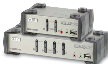
CS1732B / CS1734B

The CS1732B and CS1734B are, respectively, 2- and 4-port desktop KVM™ switches that support multiple platforms (PC, Mac or Sun hardware with Mac, Windows, Solaris, Linux or Free-BSD operating systems). They have HDB-15 (VGA) video and USB keyboard/mouse connections. Computer selection is done via front panel pushbuttons or a multilingual OSD (On Screen Display) function. They have high-resolution (2048 x 1536 pixel) HDB-15 video and USB keyboard/mouse connections as well as speaker and microphone connections and a USB hub for excellent multi-media capability. They are a good choice for web designers, small production studios, and applications developers.