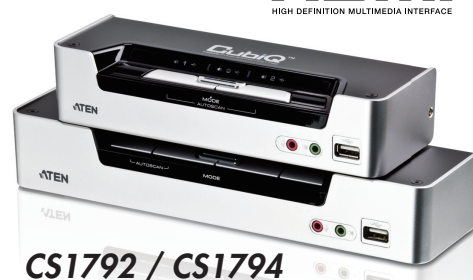
CS1792 / CS1794