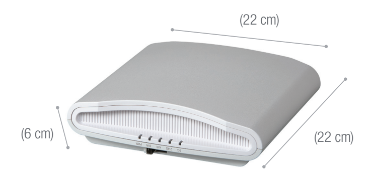
weight is 1.1 kg. (2.3 lbs.)