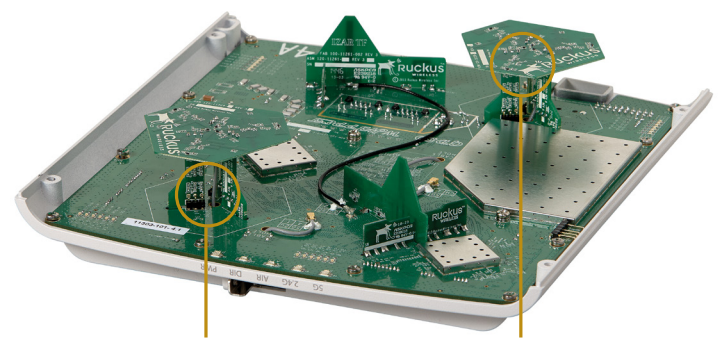
BeamFlex+ Adaptive Antenna Technology