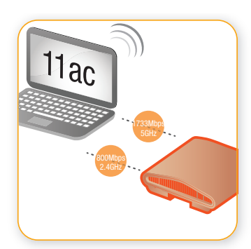
Blinding Fast 4-Stream 802.11ac