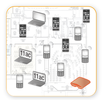
Ultra High User Density